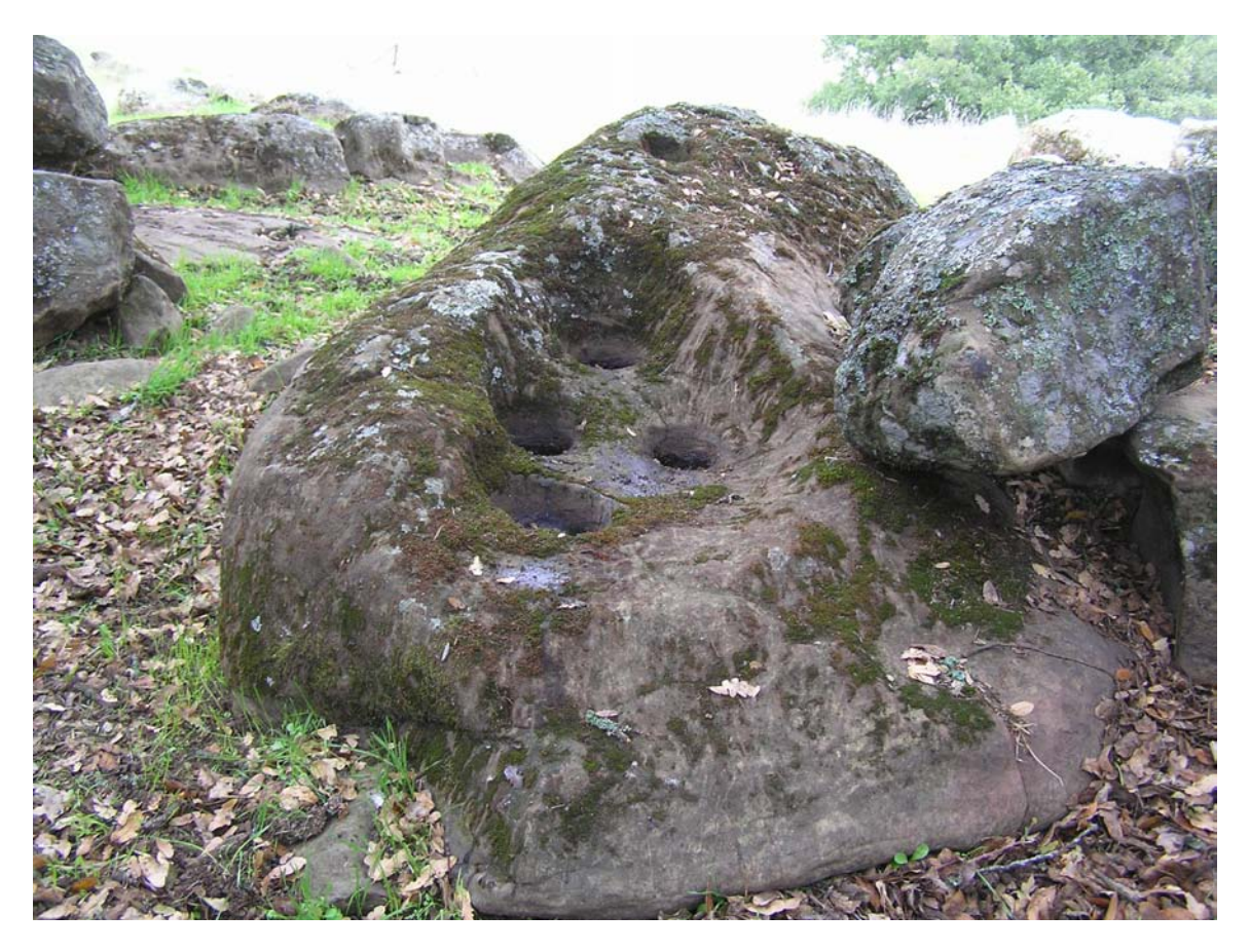
Ancient bedrock mortars at the Citadel.

would be inverted and stuck top down into a mortar hole cut into the center of a shallow circular basin. The basin would support the sides of the basket, which would provide a clean surface to hold ground and partially ground acorn meal. One should not be deceived by the reddish color of the hopper basins. It is due to the presence of red algae and does not indicate processing of a red-colored foodstuff.