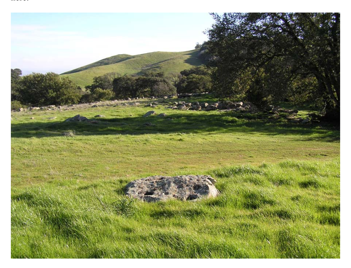
Cupule rock with bedrock mortars between the knoll and Volvon's central district.

removed three cubic feet of material. This rock testifies to Volvon's antiquity. Throughout the central district one can find old, worn-down bedrock mortars holding smaller bedrock mortars within them, another testament to long-term human occupancy here.