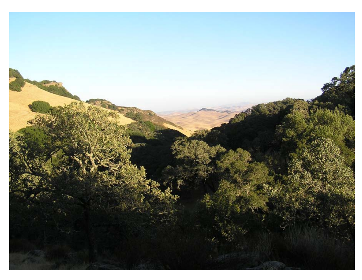
Brushy Peak and beyond. From the eastern tip of Volvon.