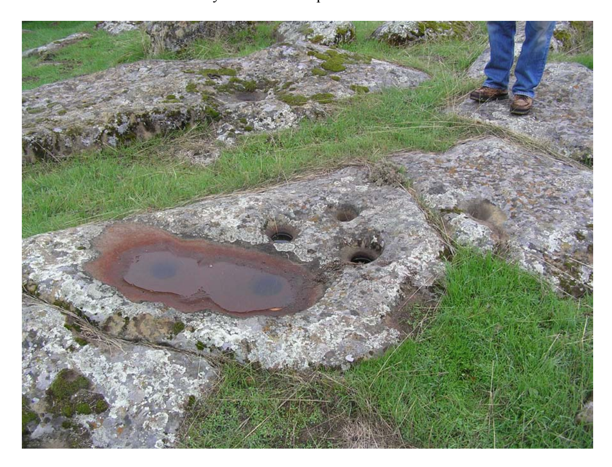
Basket hopper mortars.

Volvon was the principal settlement in the Volvon homeland, but not the only one. In Morgan Territory alone, five villages—along with milling stations, grinding slicks, and lookouts—exist within a narrow one and one-half square mile area north of Volvon and east of Marsh Creek.<sup>5</sup> Altogether these sites contain over 300 bedrock mortars. Thus nearly 1,000 exposed bedrock mortars lie in the heart of the Volvon homeland. Surely many more lurk beneath the surface. Other Volvon villages and milling stations exist at the foot of the hills in Round Valley and near Los Vaqueros Reservoir, in the vicinity of Rock City, in Curry Canyon and its environs, and along Marsh Creek. The abundance of bedrock mortars in Volvon suggests it was more densely populated than some have claimed.<sup>6</sup> Development has barely touched the Volvon homeland. Much of it is on public land, as are nearly all the archaeological sites. Most privately owned land along Marsh Creek and in Briones and Deer Valleys remains in a natural state. A trip to the lost city of Volvon and its environs is very much like a trip back into time.