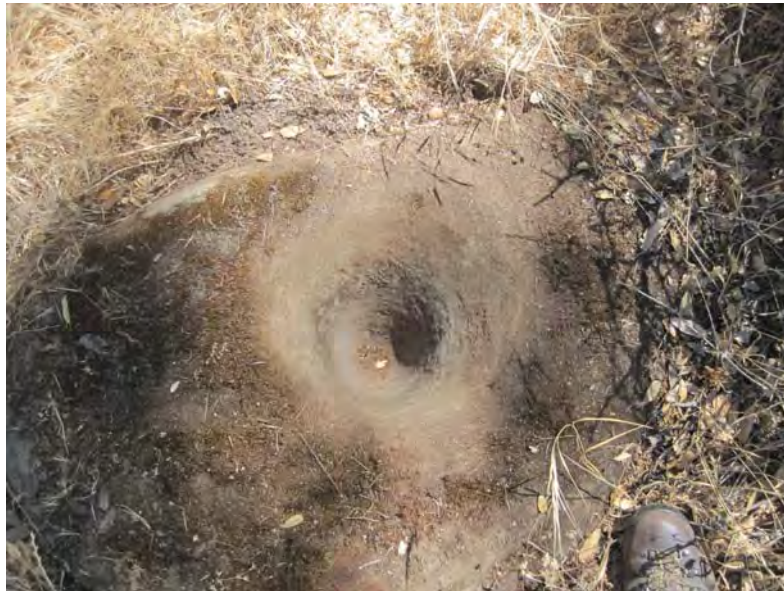
Lower Volvon Village

About half of all mortars at Round Valley are conical mortars less than 4" (10.2 cm) deep. At Volvon Village the corresponding figure is 27%. There are no distinctive basins at Round Valley, no nipples, few bowls, and just a handful of mortars that are even funnel-like. These could be better described as conical mortars with flaring mouths, as this example illustrates.