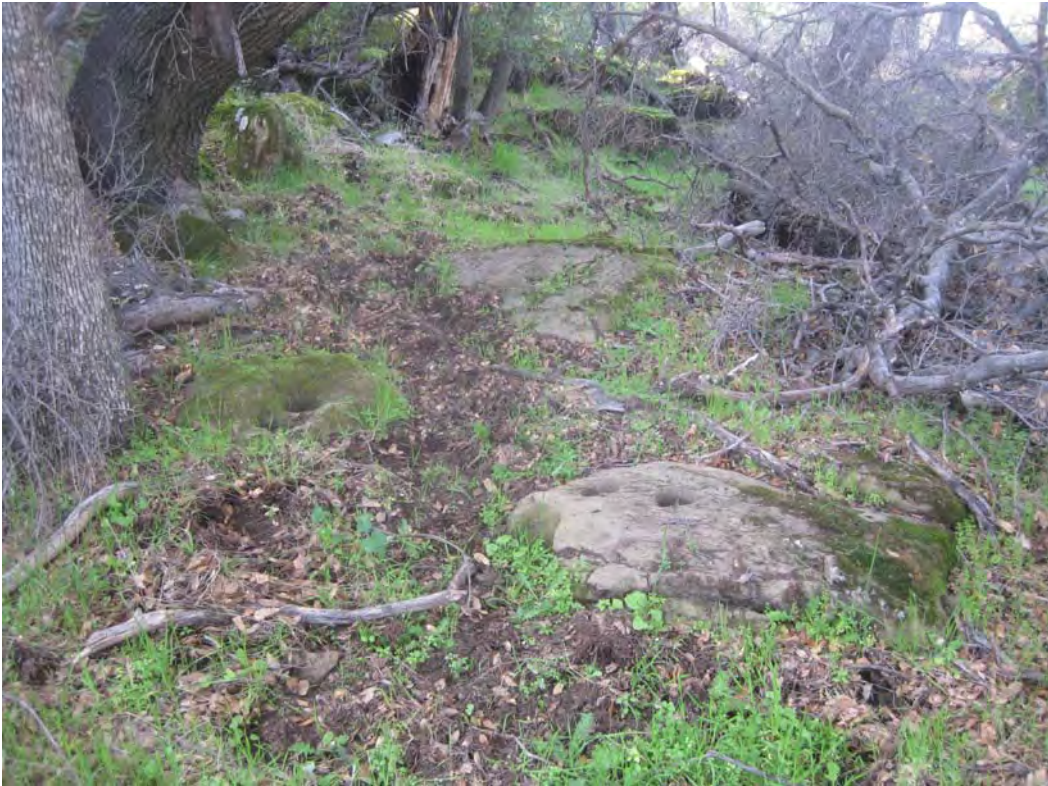
A string of rocks with bedrock mortars on them.