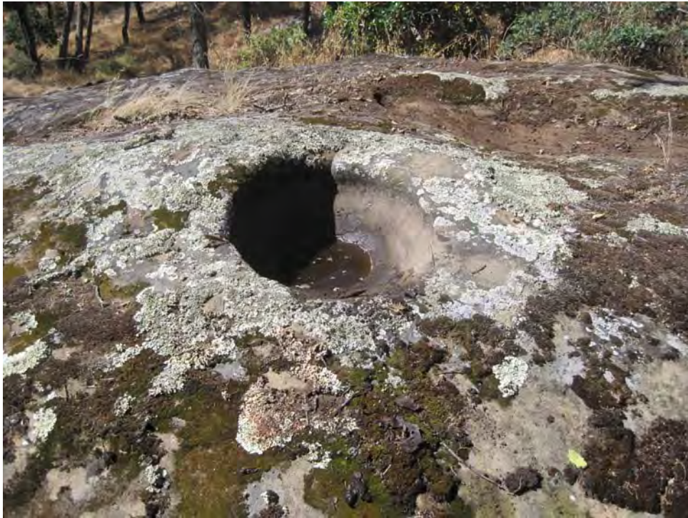
Blue Oak Trail

Behind this capacious compound mortar is a basin or slick with two shallow cones in it.