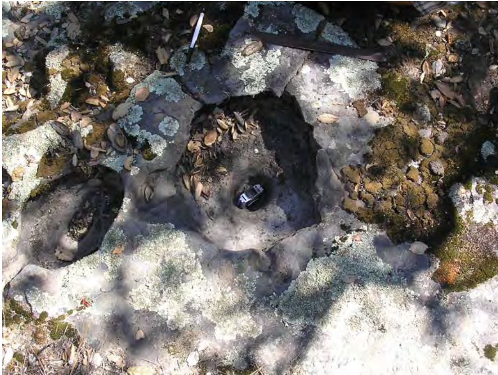
Below Rock City

Both mortar rocks at the Below Rock City site feature compound mortars. This funnel and partial funnel make a beautiful pair. Note the companion shallow mortar.