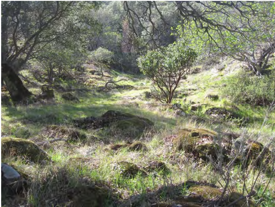
Fig Pig mortars are all conical. Two have large flaring mouths that give them qualities of funnel-shaped mortars, if not outright membership in that class.

Fig Pig mortar rocks are scattered over a fairly wide area, but most are near this short, spring fed creek.