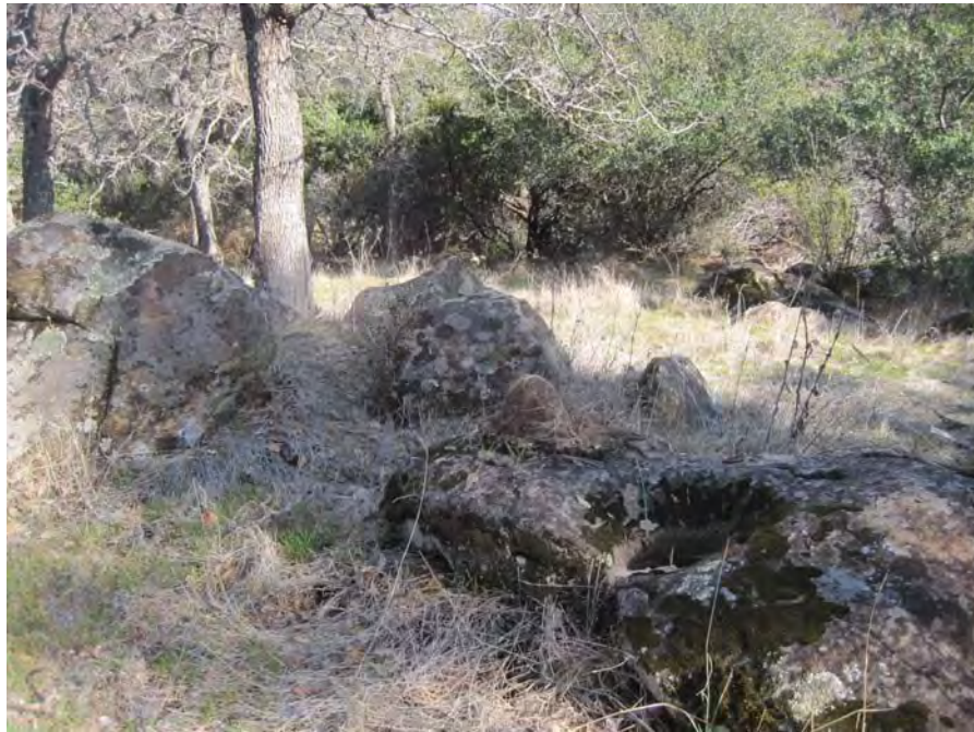
Curry Creek Milling Station

The nearly complete wide flaring mouth on this specimen could promote it to the “partial funnel” class. The missing mouth section does not seem to have simply broken off. Instead, the mortar appears to have been created with a “fishtail” opening of a type encountered elsewhere in Volvon territory. Note the parabolic vegetation plug.