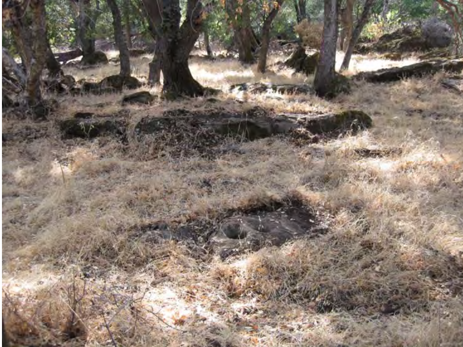
Looking out over the tsektse .

Round Valley village is perhaps the least photogenic of the bedrock mortar sites in this study. The layout of mortar rocks is nearly impossible to discern among the trees, fallen wood, high grass and poison oak. Access to parts of this village is effectively blocked to all but the most determined (and poison oak resistant) visitor. The rocks in the center of the village near the tsektse are arranged in rough bands separated by open aisles. Unfortunately, there is no vantage point from which this arrangement is clearly visible.