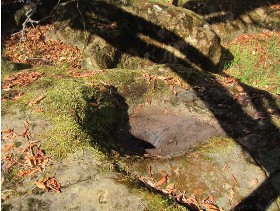
Riggs Canyon Amphitheater

As is the case at Round Valley, there are no true funnels or nipples at Pond Village. There are, however, several nice examples of mortars in basins.