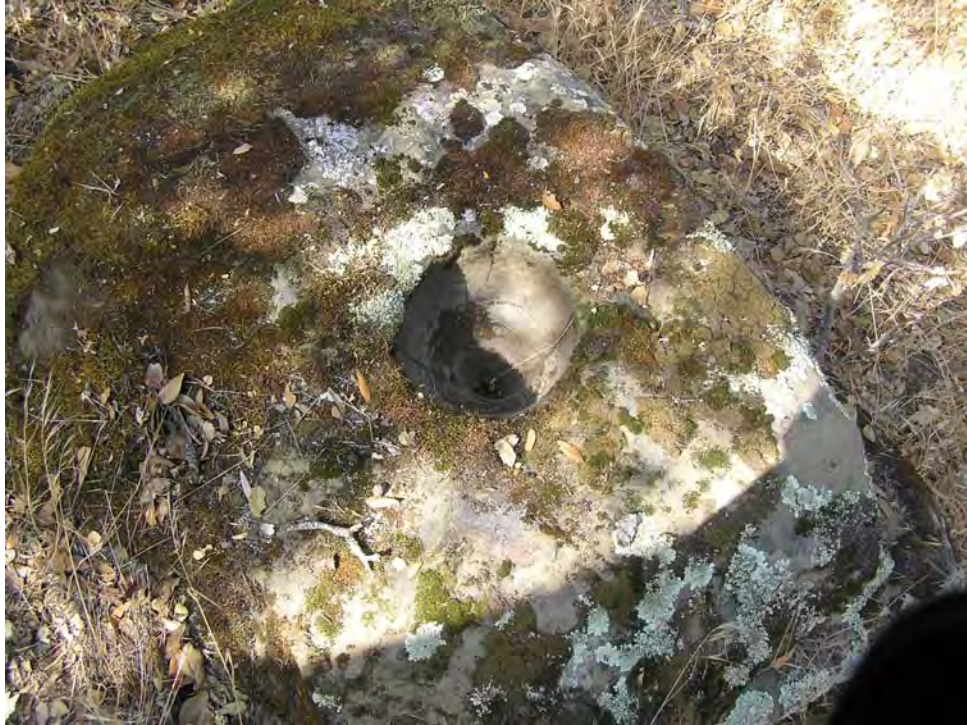
Below Cave Point

This elliptical funnel measures 10" (25.4 cm) x 8" (20.3 cm) x 9-1/2" (24.4 cm) deep to the high point of the rim.