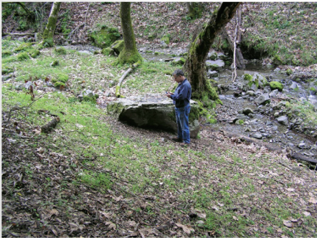
Table Rock in Millers Creek

We've been surprised not to find more bedrock mortars out in the Ohlone Wilderness. The area seems well suited to Native American needs. Look at a map of California today and you'll see a large blank space that runs from south of Livermore to Bakersfield. That's the Diablo and Inner Coast Ranges. This wilderness extends the full length of it. These mortars are on one table like rock sitting right next to the creek.